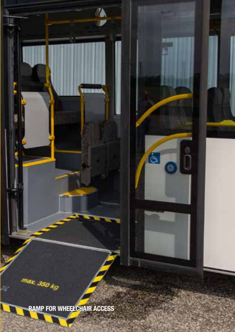
RAMP FOR WHEELCHAIR ACCESS max. 350 kg