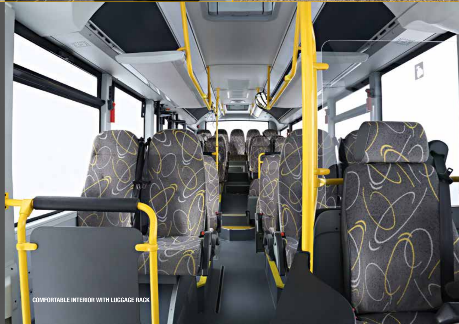
COMFORTABLE INTERIOR WITH LUGGAGE RACK