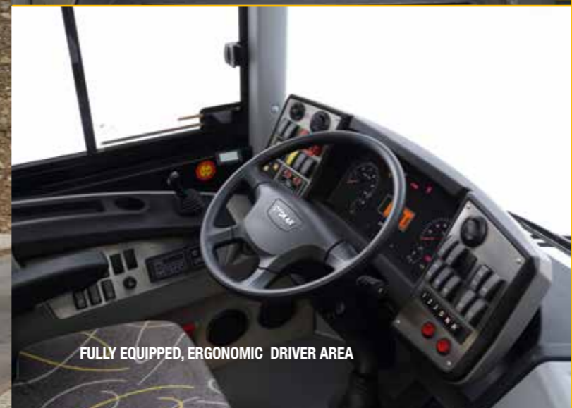
FULLY EQUIPPED, ERGONOMIC DRIVER AREA